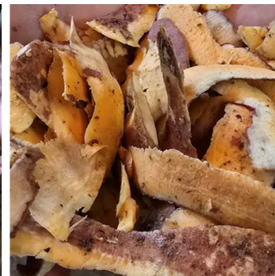
Sweet potato peeling service at Cooperative facility. The peeled sweet potatoes will be sent to the food processing factories and the sweet potato peels will be collected by the designated agricultural waste collector.

合作社设施的甘薯去皮服务。去皮后的甘薯将被送往食品加工厂，甘薯皮将由指定的农业废弃物收集商收集。