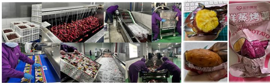
Additive-free vacuum-packed steamed fresh sweet potato 无添加剂真空包装蒸鲜薯