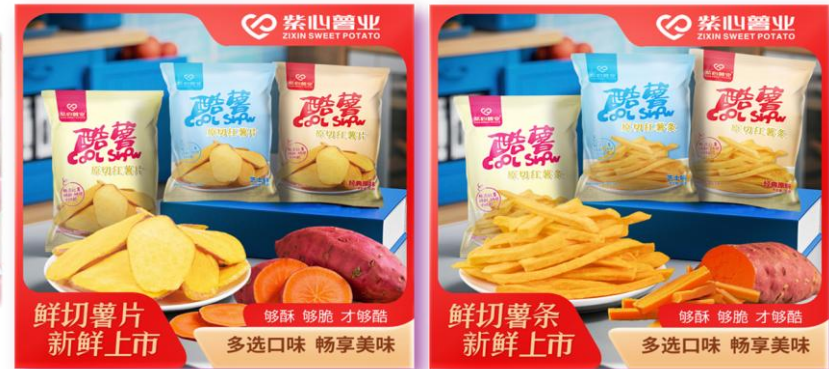
Newly launched sweet potato chips and fries 新推出的红薯片和薯条